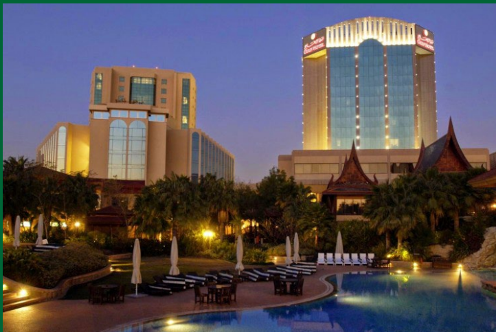
Gulf Hotel - Manama