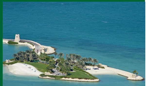
Private Island - Ritz Carlton Hotel

Participants will enjoy the traditional heritage of Bahrain, tasty traditional food at the beach environment and lovely .weather at Ritz Carlton private island