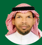
Majed Alfawaiz Secretary General

National Council of Occupational Safety & Health