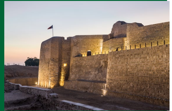
Bahrain Fort - Seef Area