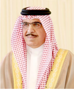
In attendance of H. E. General Shaikh Rashid bin Abdullah Al Khalifa Minister of Interior, Kingdom of Bahrain